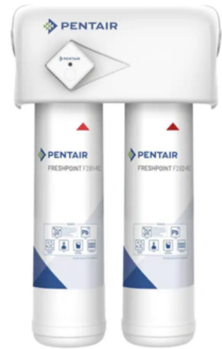
Manufactured by Pentair

Transform ordinary tap water into clearer, more refreshing water with the turn of your tap. The Pentair FreshPoint F2000 Under Counter Filtration System features a set of twin carbon blocks with lead reduction media to reduce sediment and more than 60 contaminants, like chlorine, lead, Cysts*, and volatile organic compounds (VOCs).