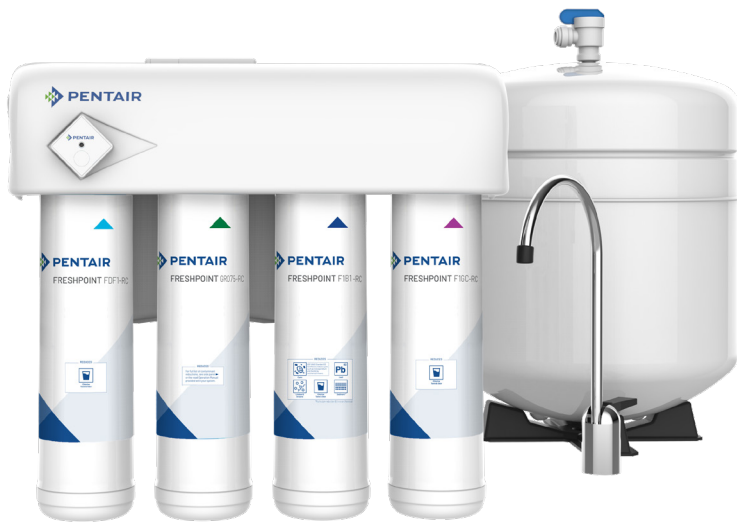
GRO-475M, (with filter life monitor) shown